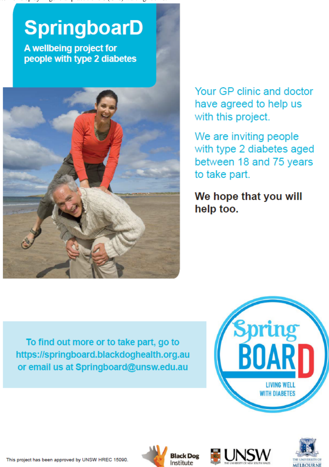
Figure 1. Poster for display in general practitioners (GPs) waiting rooms.